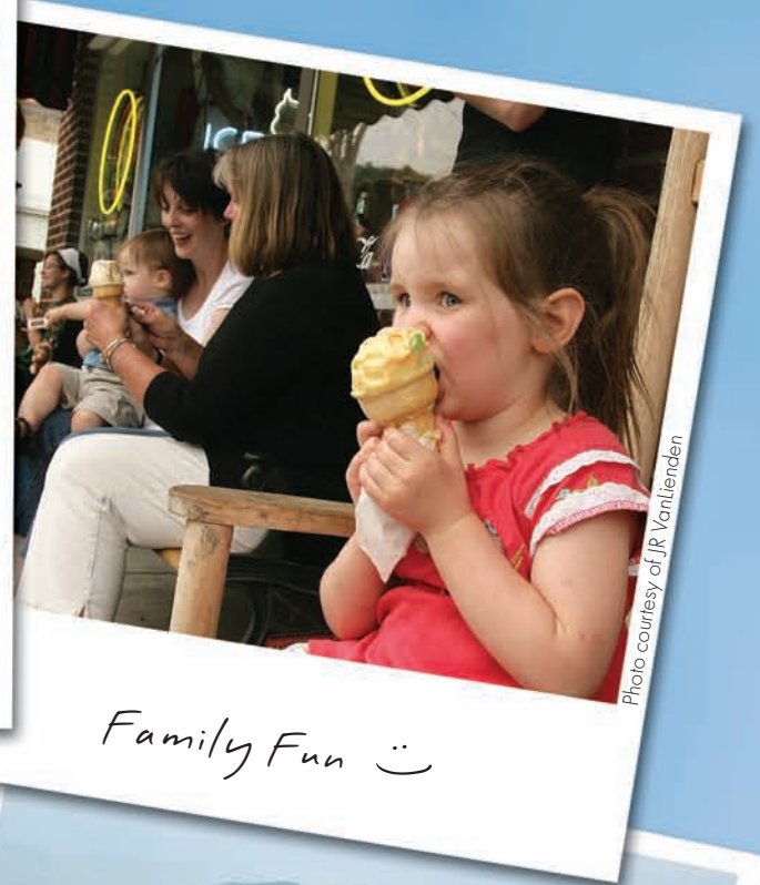
Family Fun ☺