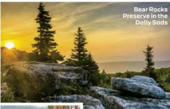
Bear Rocks Preserve in the Dolly Sods

GEAR It stocks plenty of hiking supplies, but it's not really fair to call the Nantahala Outdoor Center a gear shop—what's the best word for a gear shop/whitewater rafting outfitter/live music venue/BBQ joint/hiker bunkhouse/AT thru-hiker rite of passage? 13077 W. Hwy. 19