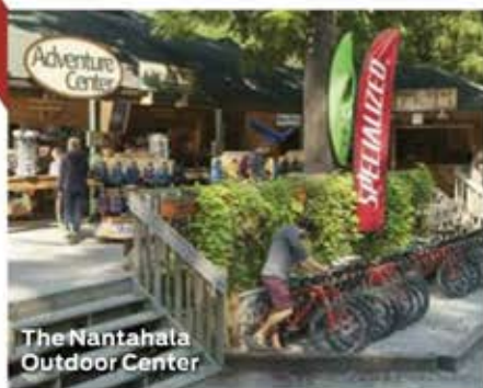
The Nantahala Outdoor Center