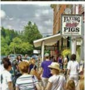
The Purple Fiddle