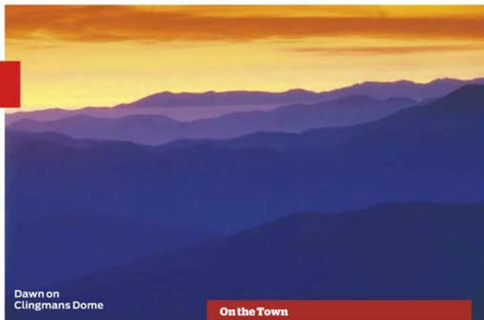
Dawn on Clingmans Dome