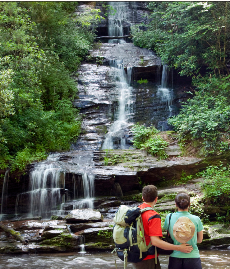
↓ Tom Branch Falls