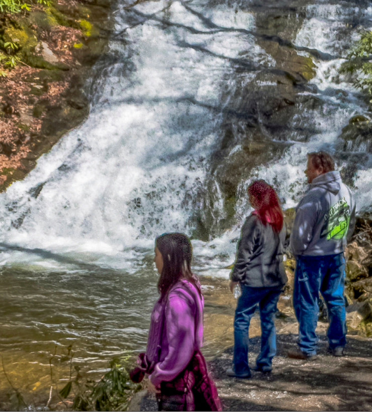
↑ Indian Creek Falls